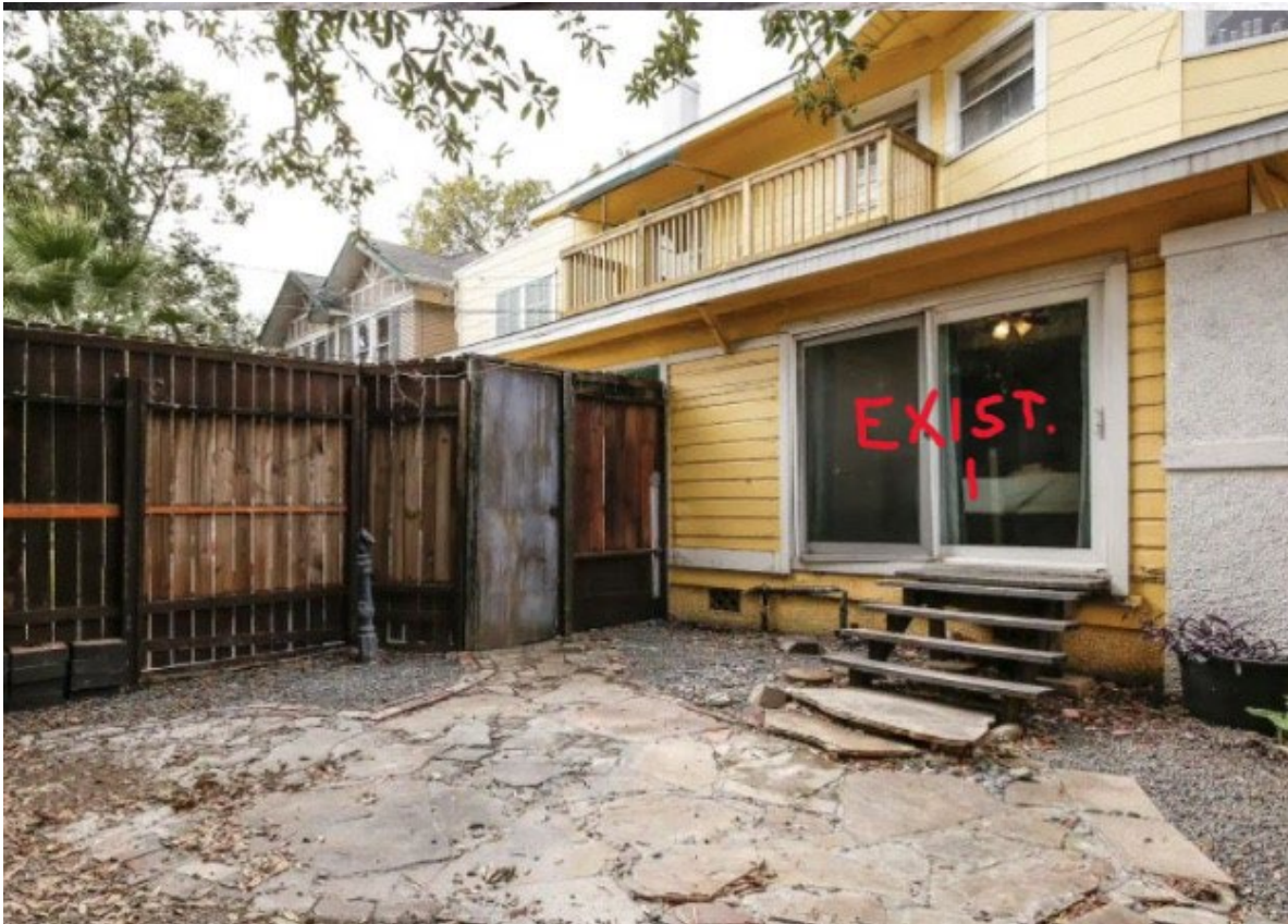
Before window alteration